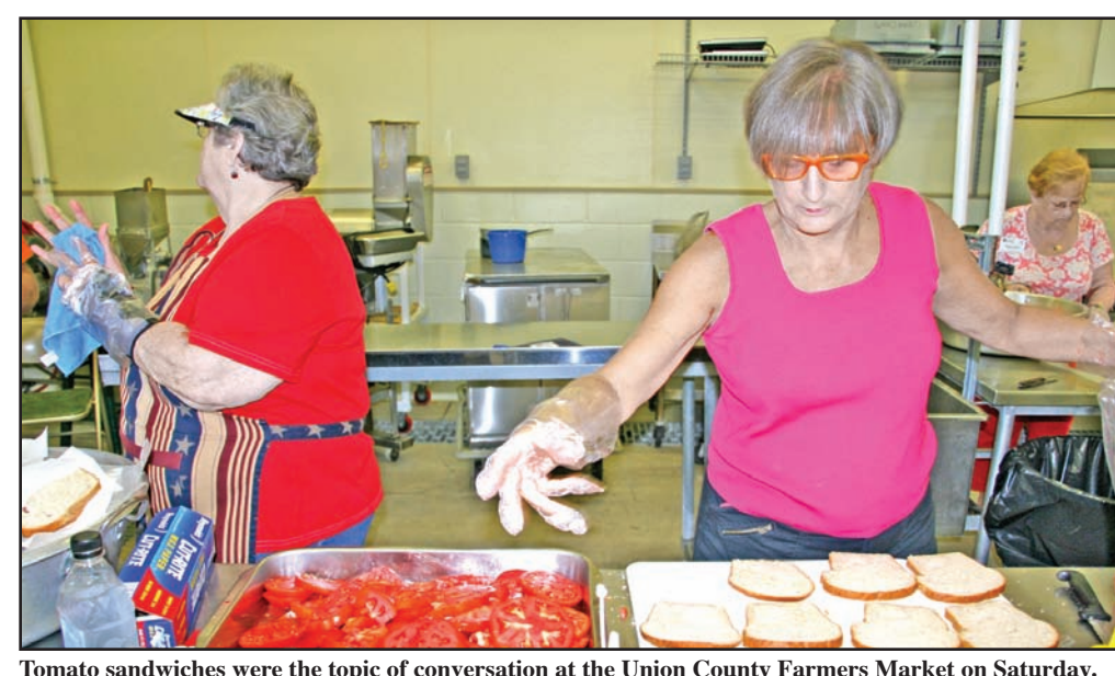
Tomato sandwiches were the topic of conversation at the Union County Farmers Market on Saturday.