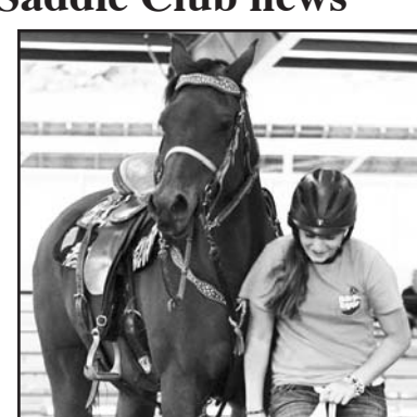
On September 6, Fun Show

to miss the Benefit Fun Show on September 13 at noon. We'll have all the old favorites like panty race, catalog race, and cupcake race. There will be great prizes for all fun events and for the overall points winner and runner-up for the day. Everyone can participate--