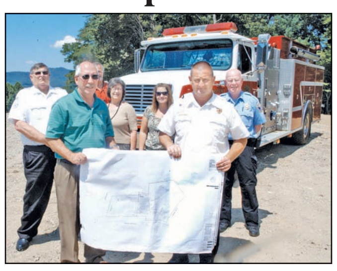
Union County officials and Fire Department personnel are excited about moving forward with additional facilities at Fire Station 1.

room," Chief Worden said. "We're elbow-to-elbow; we need more space as soon as we can get it.