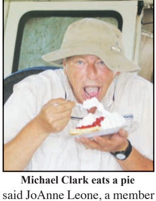
of The Market Committee. "The local restaurants and food purveyors will be gathering along with our regular produce and food vendors to bring you a taste testing of all

ter yet, tasted for $5. "The Market will be celebrating great foods including barbecue, salads, grill specialties and luscious desserts,"