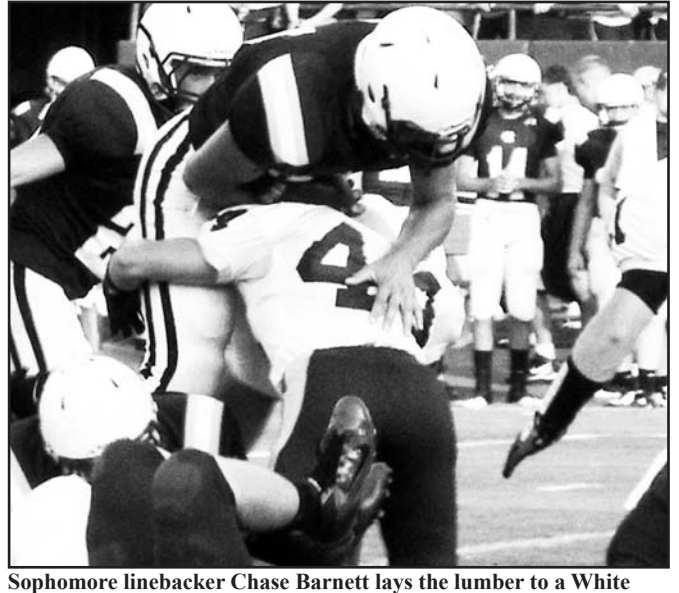
County ball carrier.