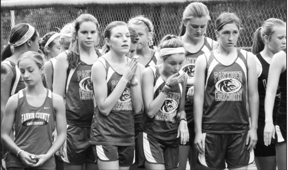
The Union County Cross Country Lady Panthers anxious to begin the season.