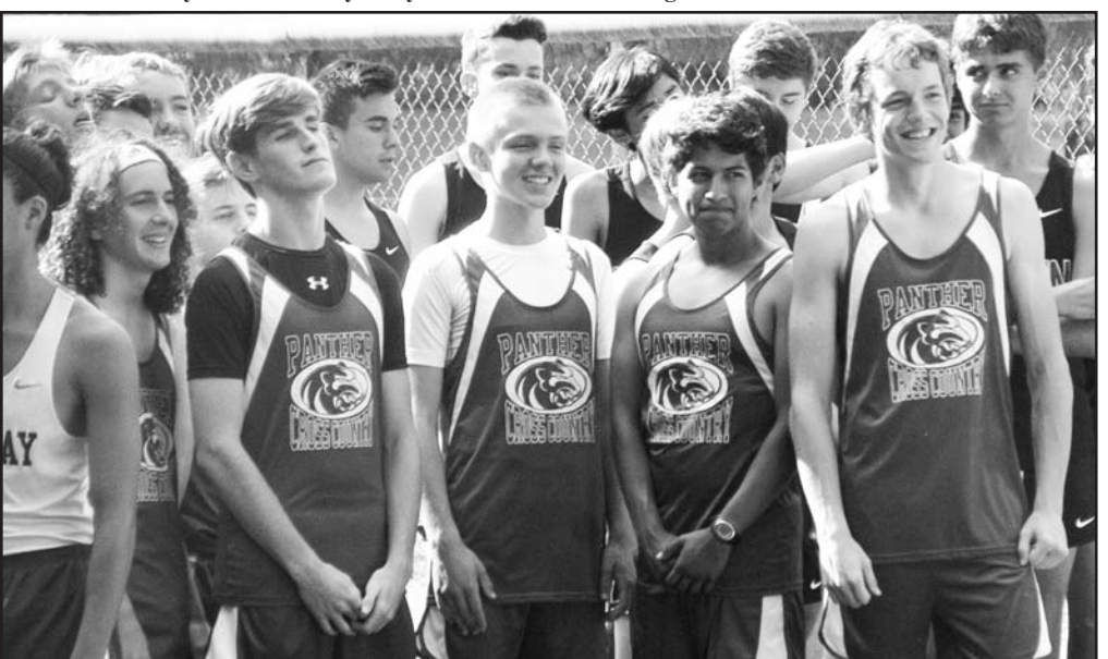
The Union County Cross Country men wait patiently at the starting line.