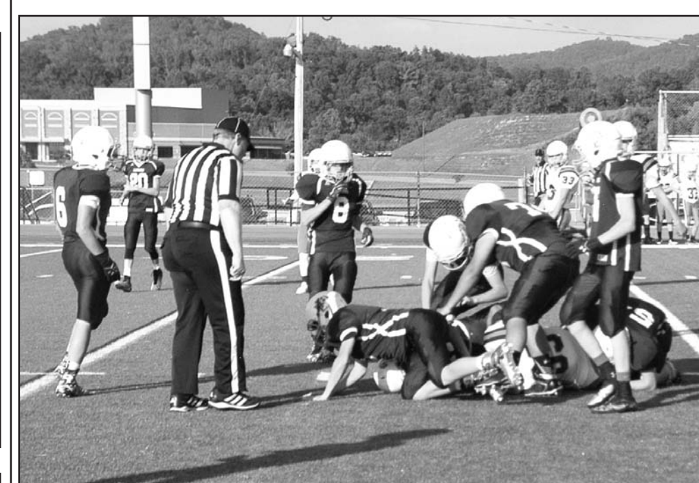
The UCMS Panthers' defense smothers a Habersham running back.