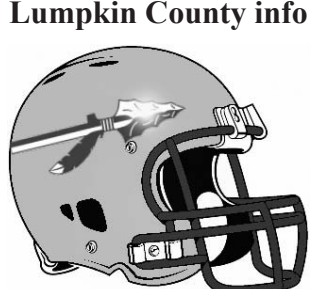
Location: Dahlonega Nickname: Indians Colors: Purple & Gold Coach: Ty Maxwell (2nd yr) Region: 7-AAA 2014 record: 5-6 Last game: L 21-18 Model Last Region title: None Last State appearance: 2014 (Loss 1st Rd. - Elbert Co) 2014 result vs UC: L 28-7 Series record vs UC: 15-21-1

1:36 until the fourth quarter. Towns would go on a