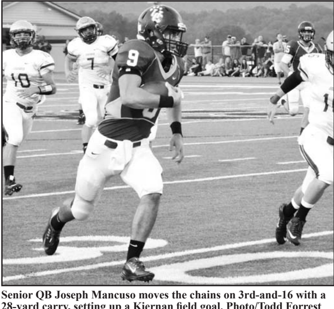
28-yard carry, setting up a Kiernan field goal.