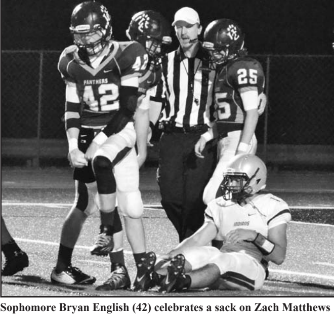
during the second half.