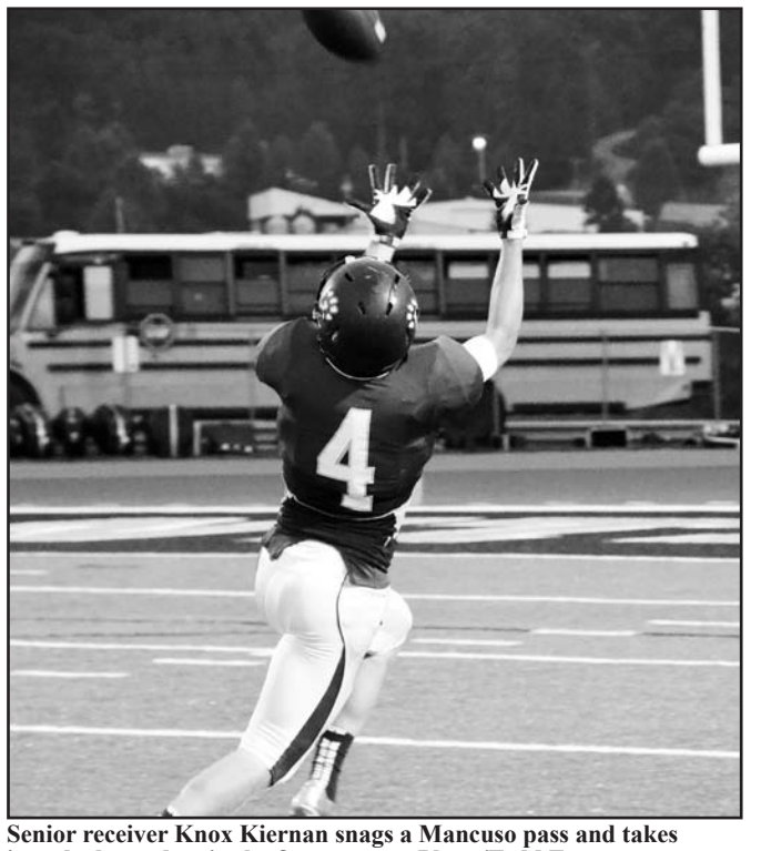
it to the house late in the first quarter.