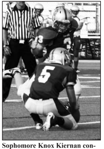
verts the PAT vs Fannin County.