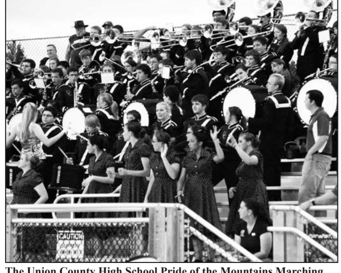
The Union County High School Pride of the Mountains Marching Band provide Panther fans with entertainment during the games and at halftime.