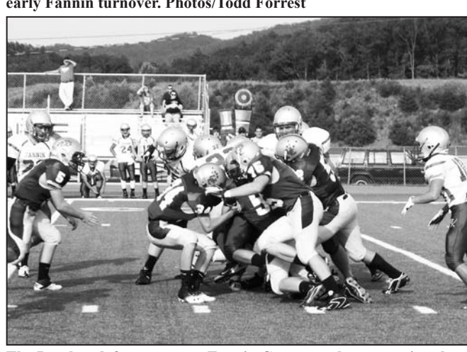
The Panther defense swarms Fannin County early, preventing the Rebels from gaining any traction.