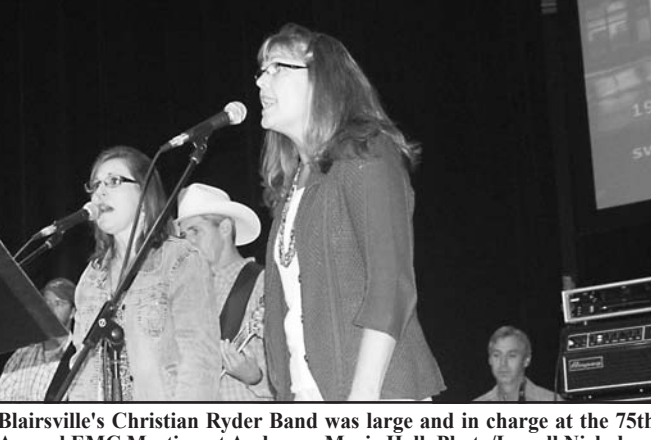
Blairsville's Christian Ryder Band was large and in charge at the 75th Annual EMC Meeting at Anderson Music Hall.

that use 608 million kilowatthours annually. In addition, BRMEMC