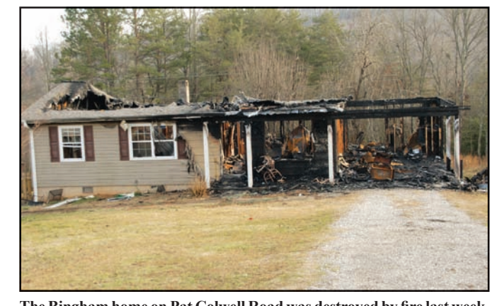
The Bingham home on Pat Colwell Road was destroyed by fire last week. The family of four is homeless and in need.