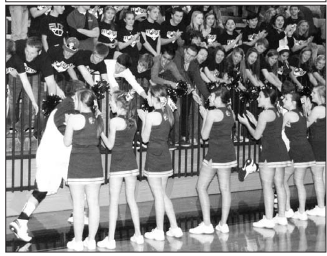
The Panthers enter the arena with cheerleaders and Pit Crew.