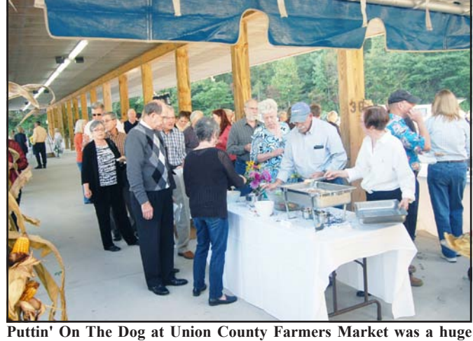
success on Saturday, raising funds for The Mountain Shelter. Photo/ the dog meant to make a flashy they sauntered around holding

"Dog" was slang for style, or splurge, so to put on