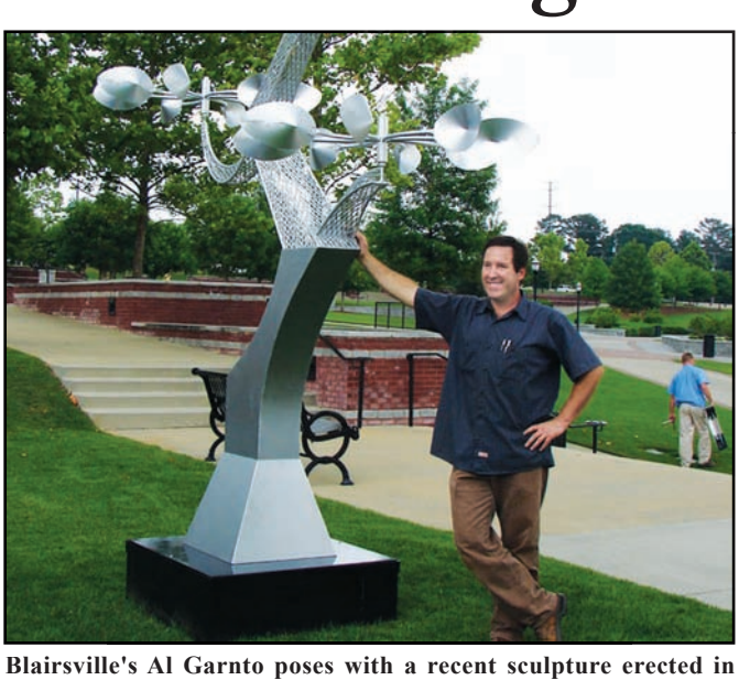
Suwannee. He'll be unveiling a new one in Blairsville soon.

Meanwhile, as Weathervane whirls in the breeze,