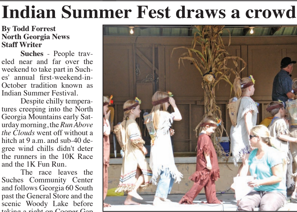
Woody Gap School students put on the play that tells the story of the Indian Summer Festival.

Suches Community Center and follows Georgia 60 South past the General Store and the scenic Woody Lake before taking a right on Cooper Gap See Fest, 3A