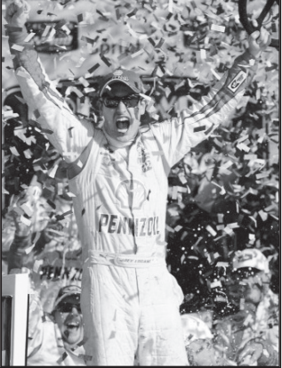
Joey Logano, Kansas Sprint Cup race winner

Ryan Newman switched from Stewart-Haas Racing at the end of the 2013 season to Richard Childress. He has not