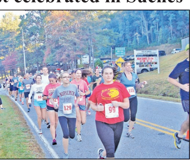
Runners hit the road early in Suches on Saturday for the Run Above the Clouds.

Following their trek See Indian Summer, 2A