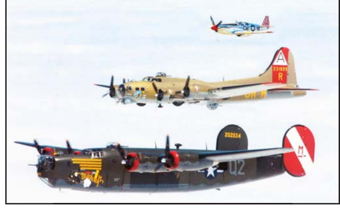
Come and visit history Oct. 21st through Oct. 23rd at the airport.

The nationwide Wings of Freedom Tour is in its 24th year and visits an average