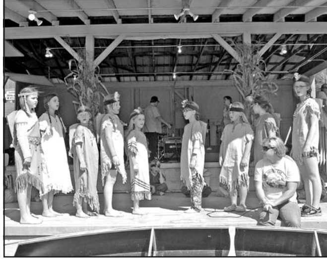
The annual Cherokee Drama performed by students from The Woody Gap School at the Indian Summer Fest.

30 years ago." Located off Highway 60 and just a stone's throw from Highway 180, the festival has become a popular stop for bikers, who venture to the