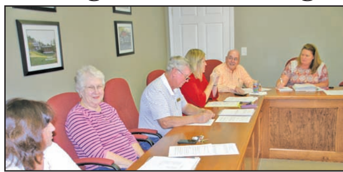
Blairsville City Council Purple Heart City was a timely gesture of good faith and local