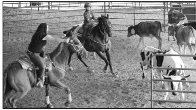
Ranch sorting is fun, challenging and gives horses a job to do.

Anyone who wants to practice sorting can do so from noon until 3 p.m. on October 25. Cost for practice is $10 for all youth and for UCSC members, and $15 for all adult non-members. For each person who pays to practice on Octo-