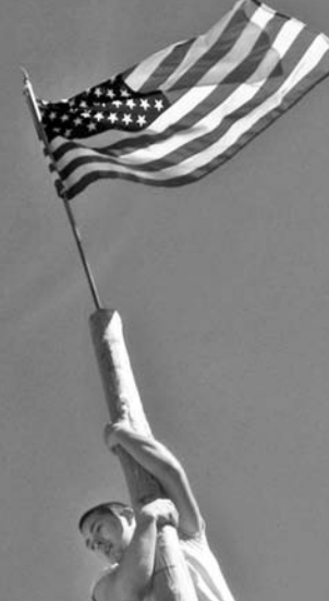
The 43rd Annual Sorghum Festival was a blast.