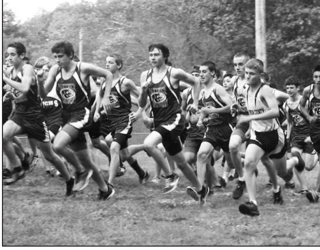
Union looks for a strong start at Meeks Park.

"Next week is our fall break, but we are still going to practice every day," Coach Hughes said. "We will