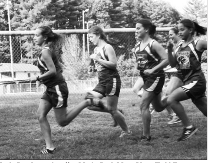
Lady Panthers take off at Meeks Park Meet.