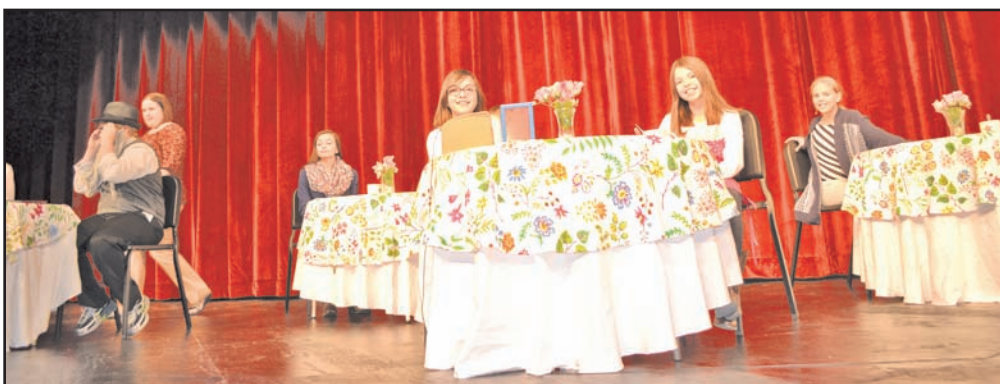
Union County Middle Schoolers present Death by Chocolate at new Fine Arts Center