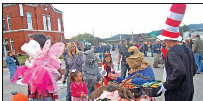
2014 Halloween on the Square is a big hit

Fire Station 10 has turned its station into a haunted house, but this year, the station