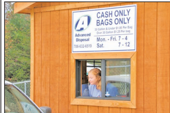
New Convenience Center open for business