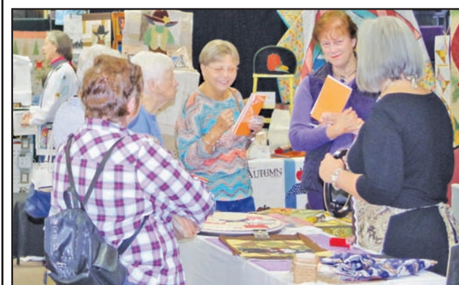
2015 Quilt Guild Show a huge success