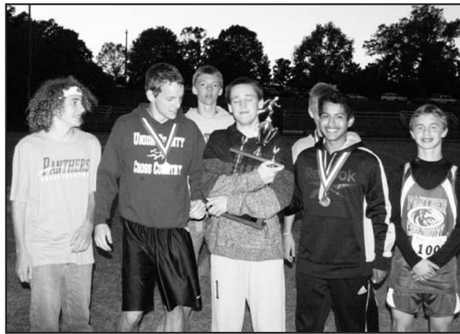
The Union County men placed three runners in the top six - good enough for an 8-AA Region title.

As for the men, Union freshman Lance Underwood and Greene County's Arthur Porter distanced themselves from the pack. Coming down the home