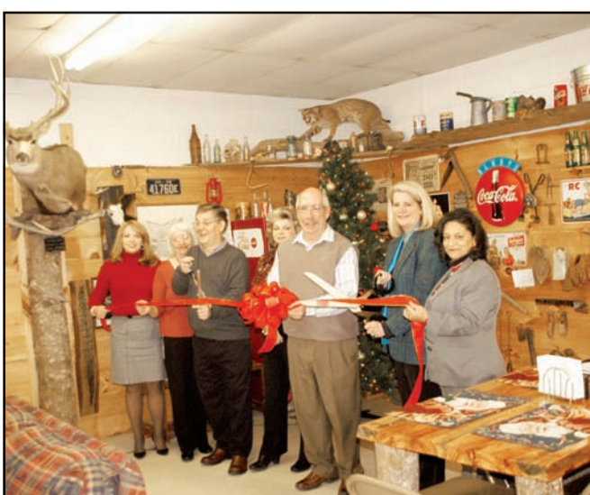
The Gooch Family was humbled to become a bigger part of the Suches Community. The store is the first Village Post Office in the nation.