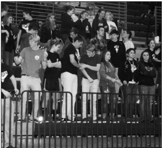
The UCHS Pit Crew cheers on their Panthers in the final moments of Union's Friday night win over Lumpkin.

A pair of Panther miscues in the final 120 seconds