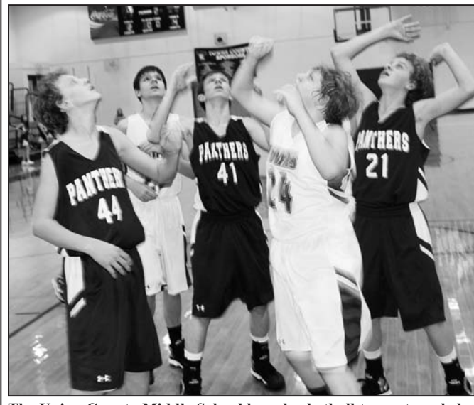
The Union County Middle School boys basketball teams traveled to Hiawassee last week and took home a pair of wins. The 7th Grade Panthers complete the season sweep, while the 8th graders got some revenge for a loss to the Indians on opening day.