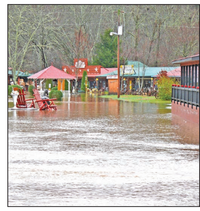
Massive flooding at Pappy's Marketplace