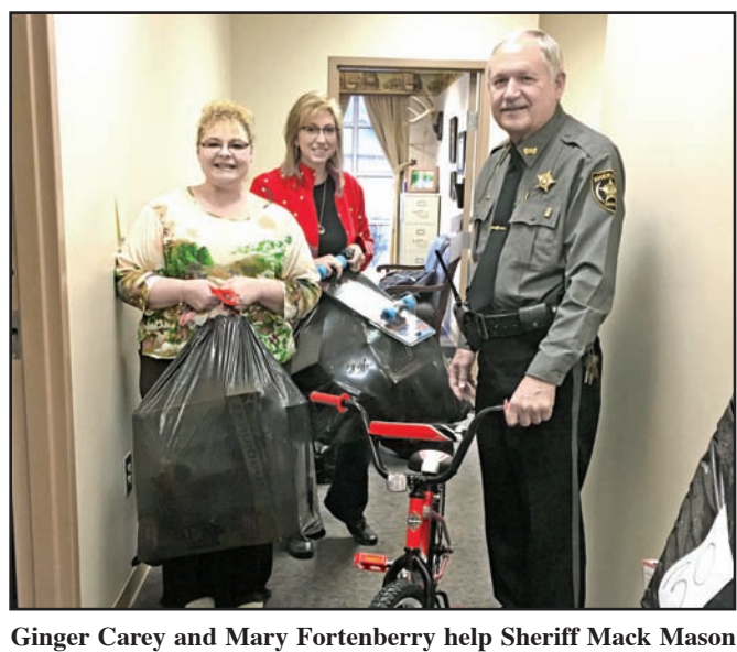
with UCSO Give-a-Gift See Give a Gift, Page 2A

Vol. 106 No. 52 2 Sections, 18 Pages Arrests 10A Church A8 Weather Thurs: Cloudy Hi 54 Lo 33 Classifieds 2B Fri: Cloudy Hi 44 Lo 26 Opinion Sat: Cloudy Hi 45 Lo 26 Legals 3B Sports