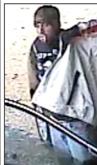
Suspects wanted for questioning by the Union County Sheriff's Office's Criminal Investigation Division.